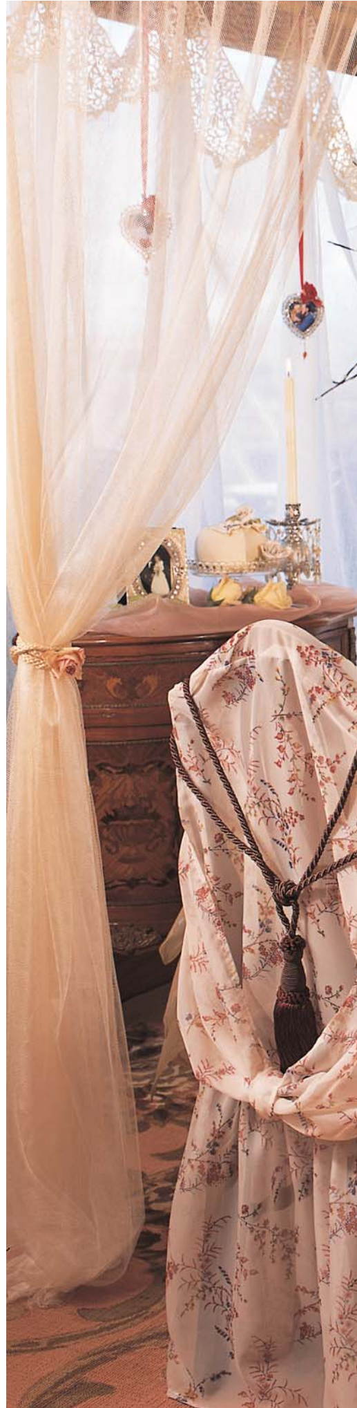
(Right) The well-used family dining room was transformed into a romantic Valentine's setting for two, using a large canopy, rose-printed rug and a lavishly adorned table.

Of course with any fabulous tabletop design, you start with the big picture. Our big picture is just a comfortable room with battered chairs and an old oak table, warm gold paint on the walls and naked windows. Some strategic layering was definitely in order. Lots of filmy fabrics softened the room's large windows and brushed the plain woodwork with elegant strokes. I've always marveled at the way plain old